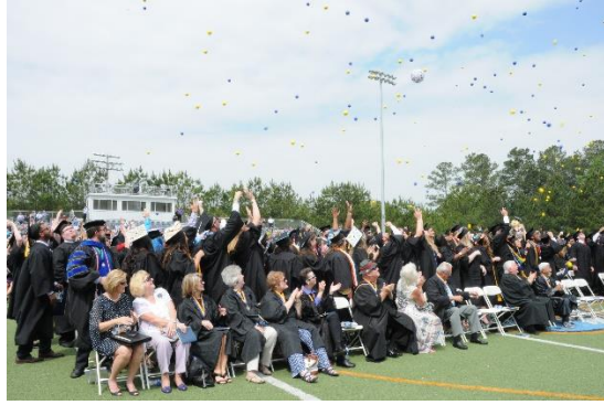
Ceremony Celebration with Blue and Gold Stress Balls